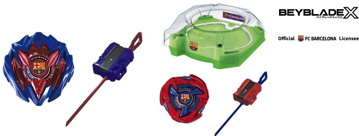
Left: BEYBLADE X "UX-00 STARTER DRANBUSTER 1-60A METAL COAT: BLUE FC BARCELONA Ver." Right: BEYBLADE X "UX-00 BEY KICK OFF SET FC BARCELONA Ver."

Prior to their release, a limited number of units of these two products will be sold at the "Asia Championship 2024" (*), an event to be held at the Fountain Plaza (alpa B1 basement) of the Sunshine City commercial complex in Tokyo's Ikebukuro district on Sunday, December 1, 2024, to determine the best Blader. (The two products will be sold only on that day at the Ikebukuro Sunshine City store of Toys"R"Us and Babies"R"Us.)