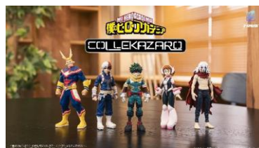
The first line of COLLEKAZARO in collaboration “My Hero Academia” will be displayed for the first time in North America

Copyright notice: © K. Horikoshi / Shueisha, My Hero Academia Project © TOMY © H. Furuhashi, BETTEN. C. K. Horikoshi/SHUEISHA, Vigilante Project © TOMY