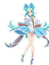
SPARK Fig first release Princession Orchestra figure

Copyright notice: ©Project PRINCESS-SESSION © TOMY